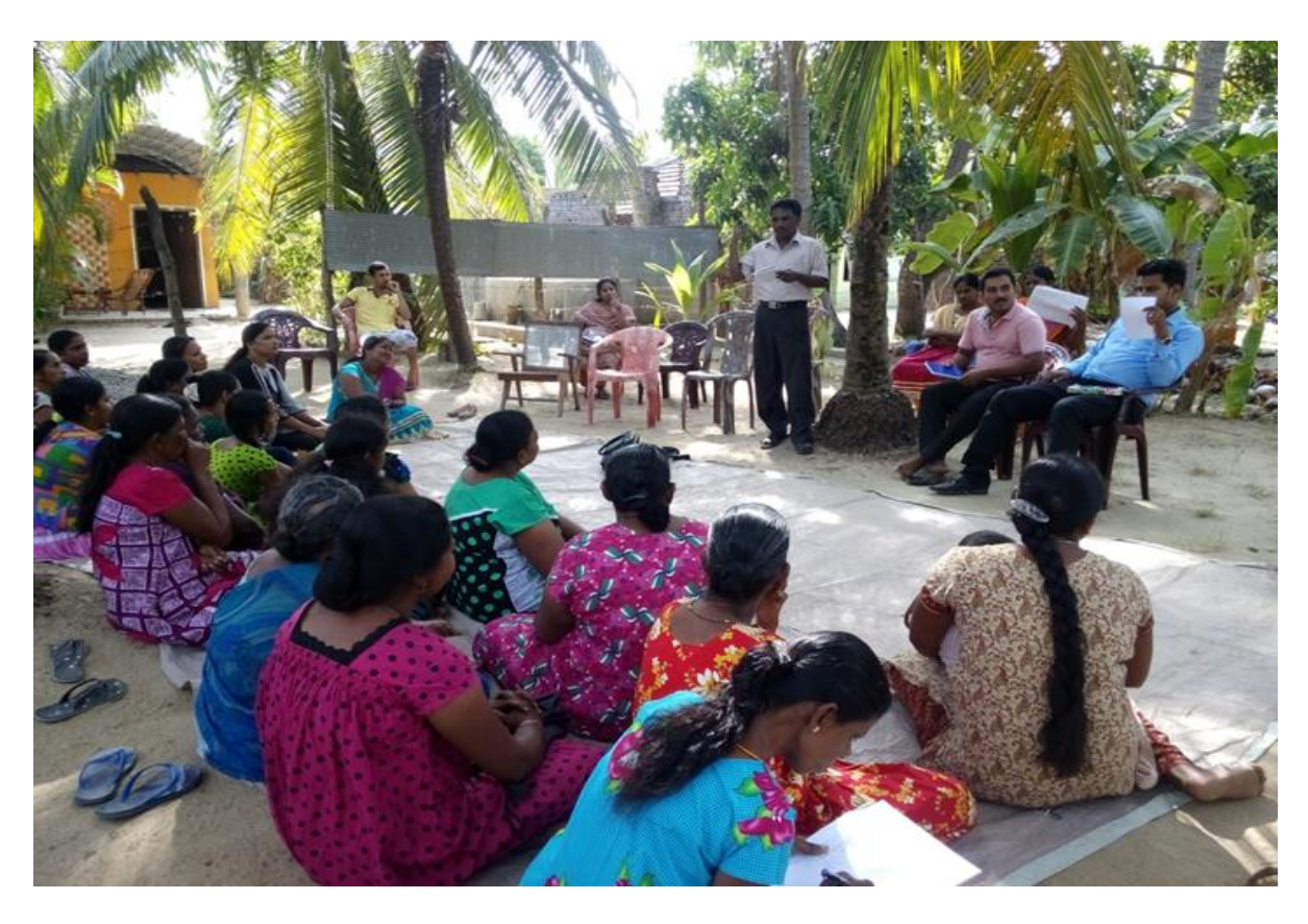
Knowledge Management - Labour Migration Project - Phase 111